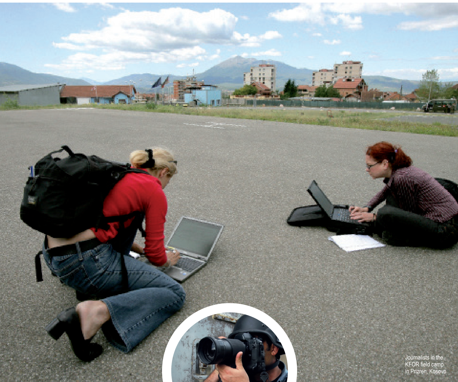
Journalists in the KFOR field camp in Prizren, Kosovo

Thomson Foundation 46 Chancery Lane London WC2A 1JE T. +44 (0)20 3440 2440 thomsonfoundation.org Twitter: @thomfound