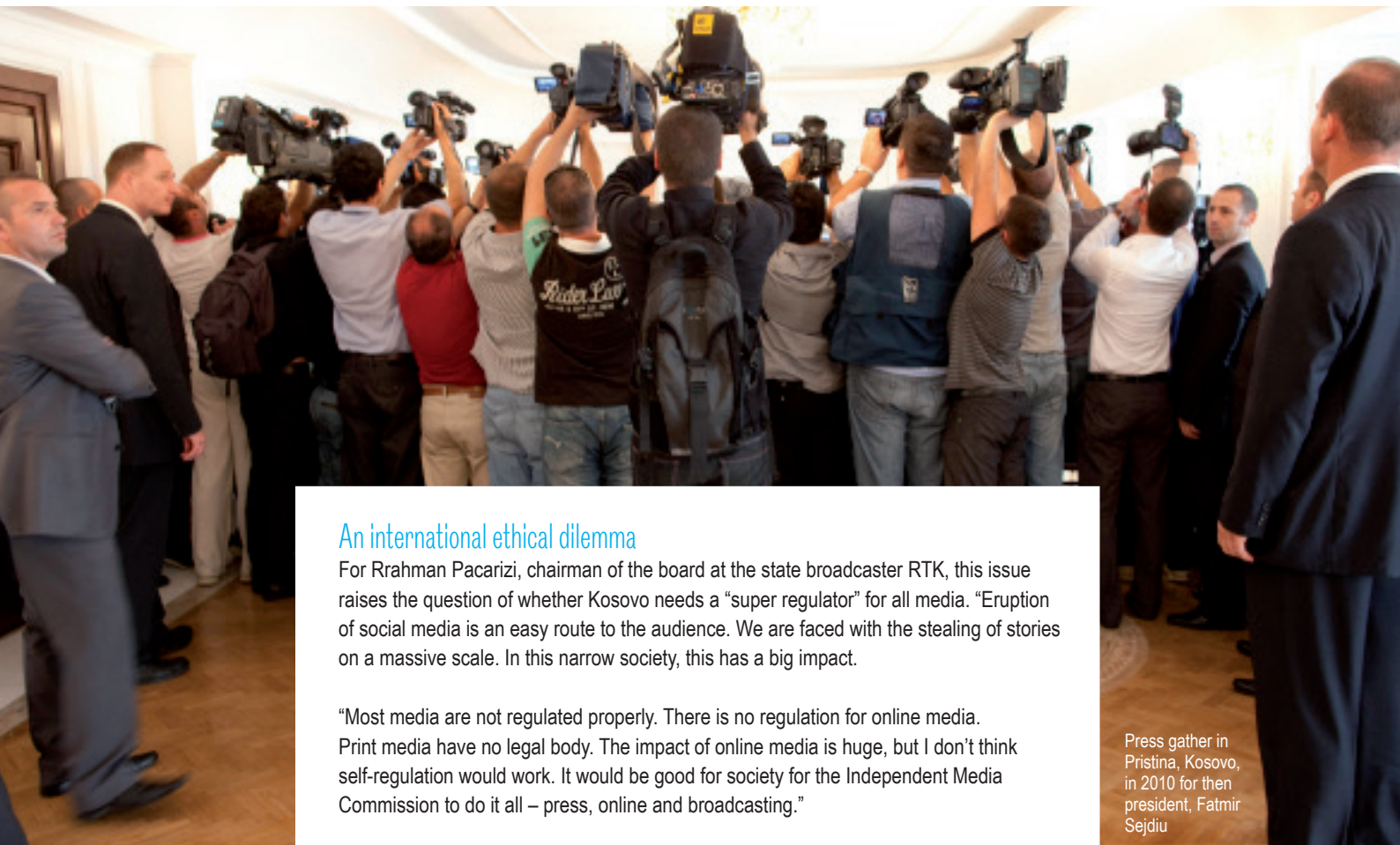
Press gather in Pristina, Kosovo, in 2010 for then president, Fatmir Sejdiu